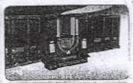
" The Egyptian Museum "

(6) - Look and write a paragraph of three sentences about :-